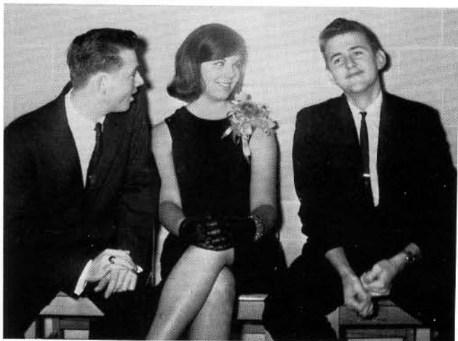
"Ladybird smiled at ME!"