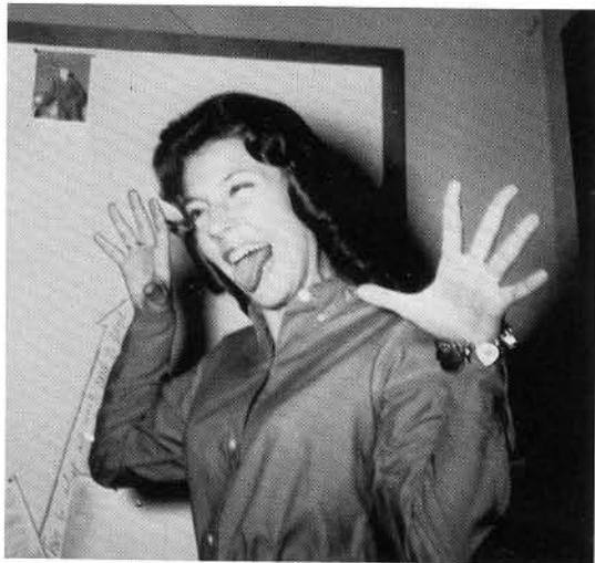
"Did you say that you have to re-type your research paper?"