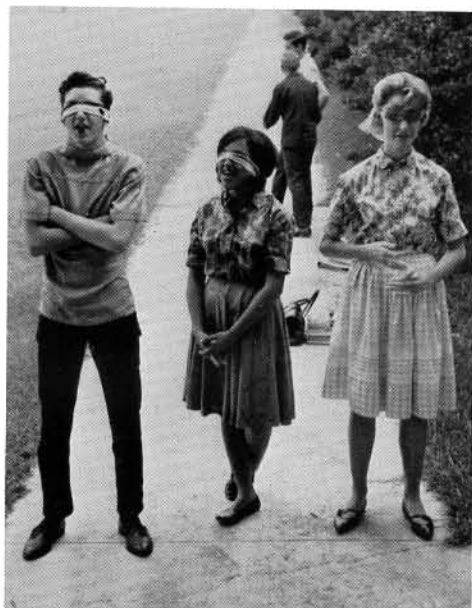
"OK, if it makes you feel better, HIDE!"