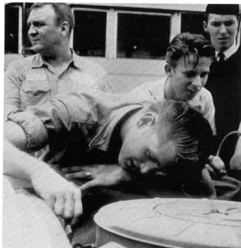
"Well, they'll just have to graduate without you!"