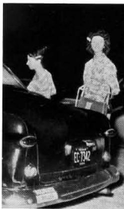
"It's not the one we came in, but it beats walking!"