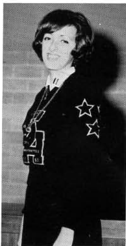
"Oh, y'all . . . !"