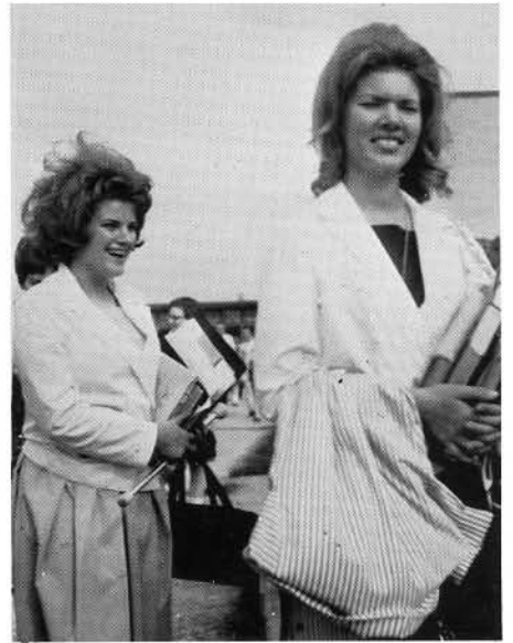
"Misery loves company."