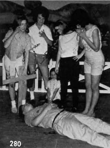
"It'll be hard, but we can move him."