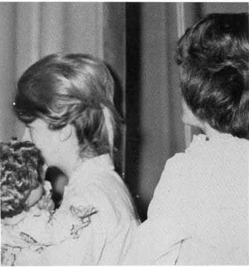
"Well, maybe she's not a Tiny Tears, but I love her anyway."