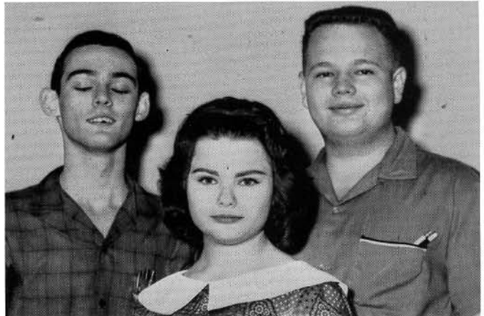
"Well, we're each entitled to our own opinion!"