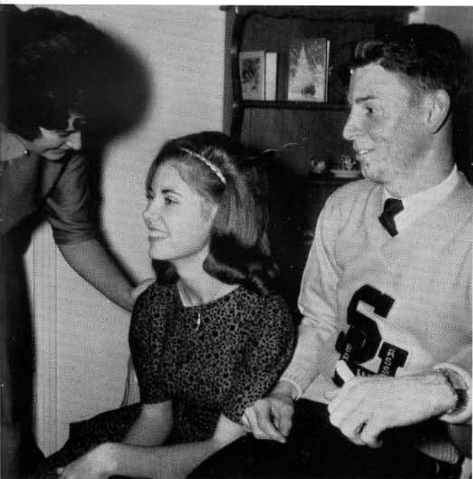
"Pardon me, but are you the girl from Happy Hollow?"