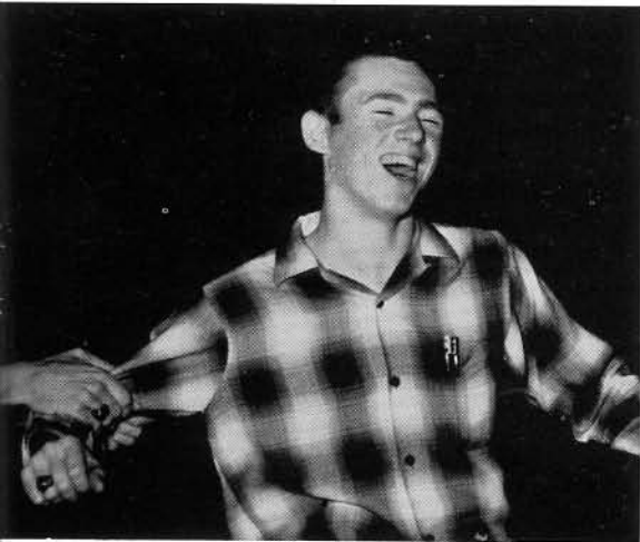
Ah, Y'all! There's enough for both of you.