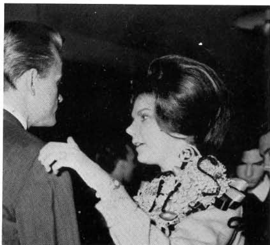
"Don't look now, but there's a bug in this corsage . . ."