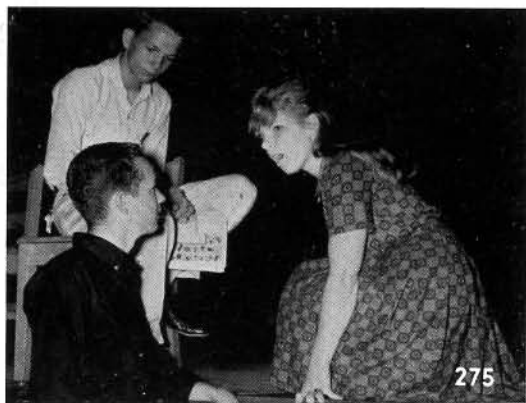
"I'd jump, but my ankles are tied together."