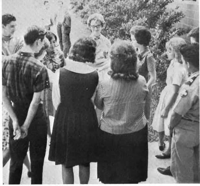
"I didn't know you could have a Stanley Party on the campus!"