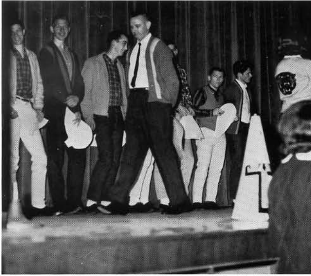
"O.K., O.K. — if you don't have an extra pair of wings, I'll stay here on earth."