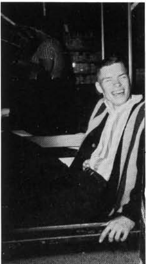
"Boy, I can really make people laugh!"