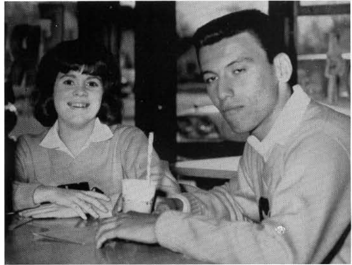
"I wish I had ordered something else."