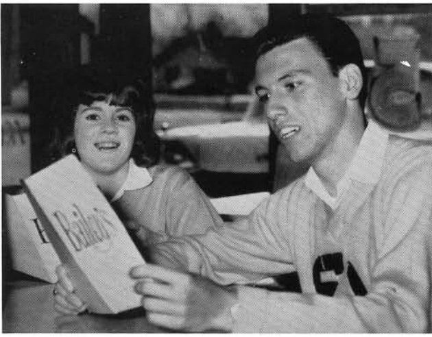
"How about Rhinoceros burger with chilled orangutan?"