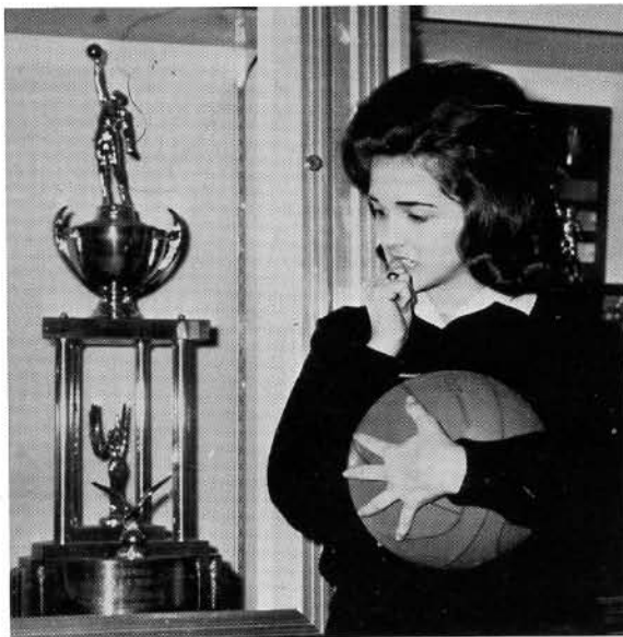
"I wonder if I should tell them that I don't even know how to play."