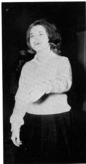
"... but Ringo, I had no idea you were coming!"