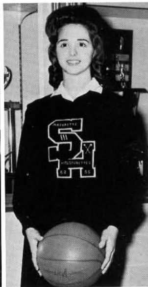
"I won't tell them, and they'll never know."