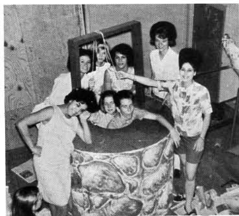
"It's a deep subject."