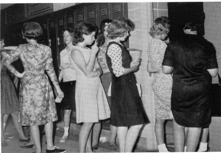
"Absolutely, no cuts."