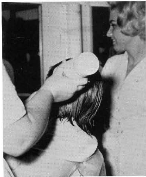
"Of course she doesn't know what we're doing, but neither do we."