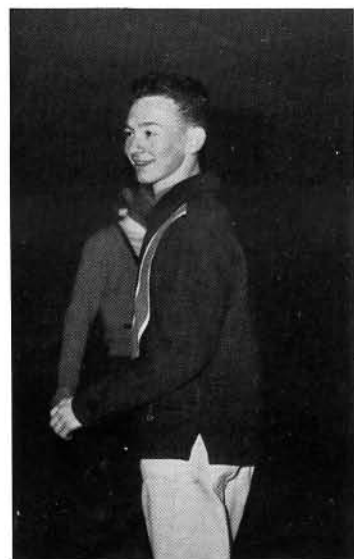
"I don't care if you are Boris Karloff, I still think you're cute."