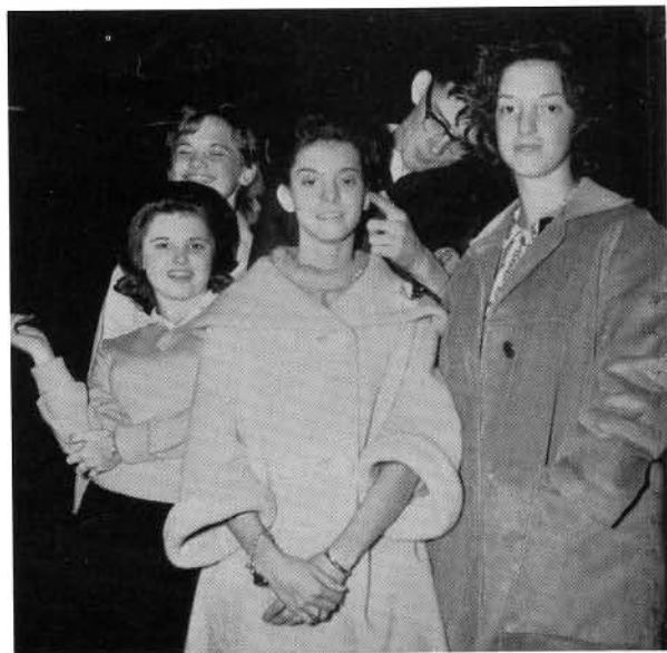
"Looking for something you lost?"