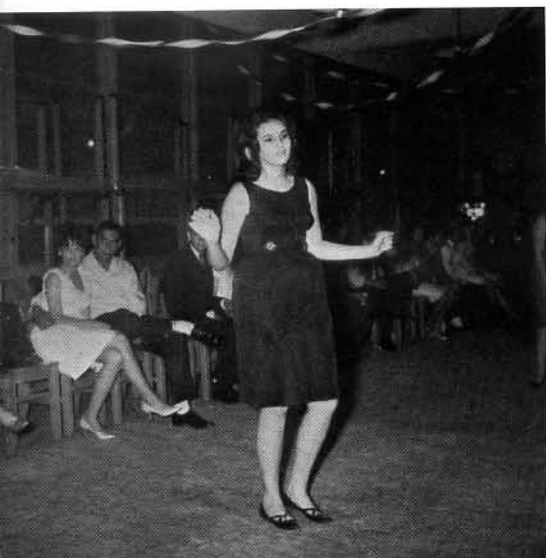
Dial WINN 7-6-832 N.Y., N.Y. and cast your vote.