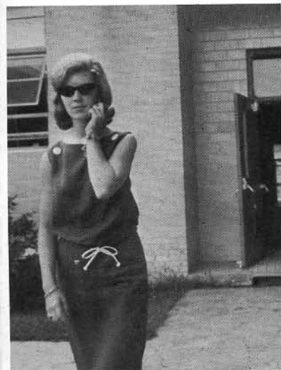
"I'll show them; I'll just run away!"