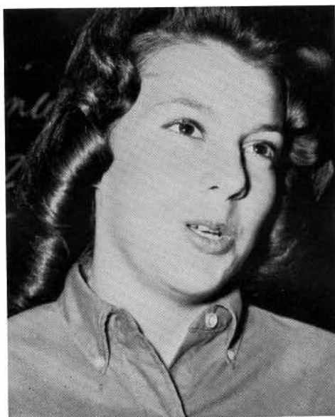
"Some people just don't understand."