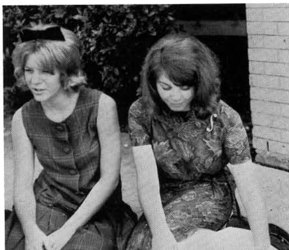
"If we just had some KOOL-ADE . . ."