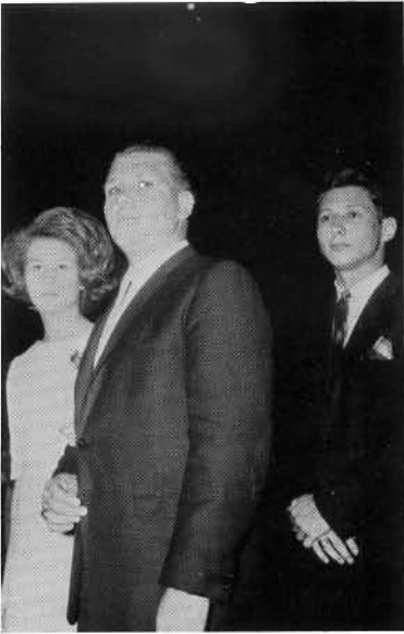
"Don't be afraid. I'll protect you."