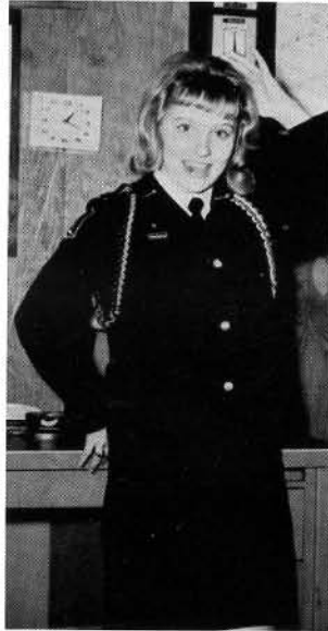
"Well, now, I've got this li'l ol' office in tip-top condition."