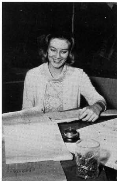
"What is this I see before me?"