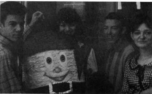
"He was a good piñata while he lasted."