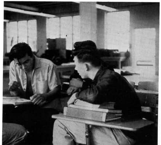
"Do you really think we've invented something?"