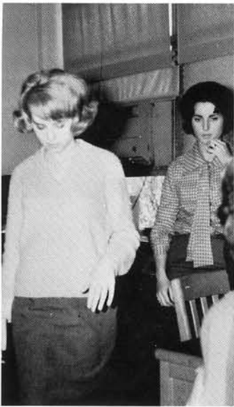
"Notice — she's having trouble trying not to step on the cracks in the walk."