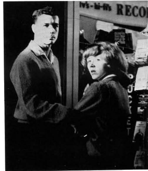
"Honest, we only bought a 'Better Homes and Gardens'."