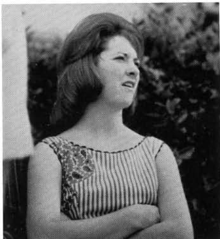
"Gosh, I sure wish Superman would come on."