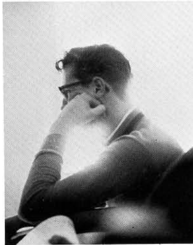
"Sometimes I wish I could make 70!"