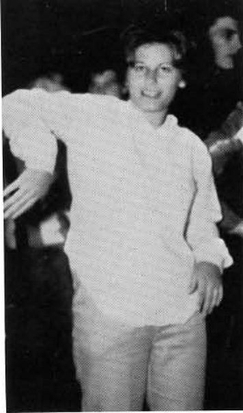
"No! This is the Frog."