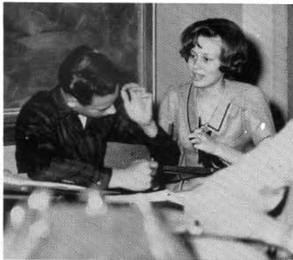
"I don't care how your pet flea can sing, I wouldn't waste money on his recordings."