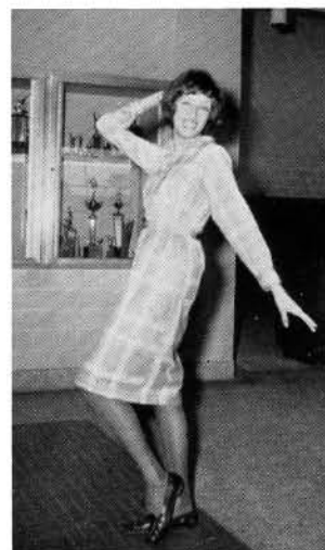
"I have 3 labs and 4 lunch periods!"