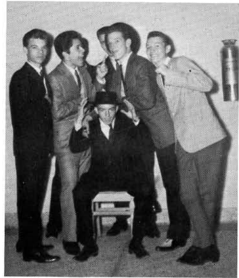
Sorry fellows, even if you are from Liverpool, we just have no demand for your talent.