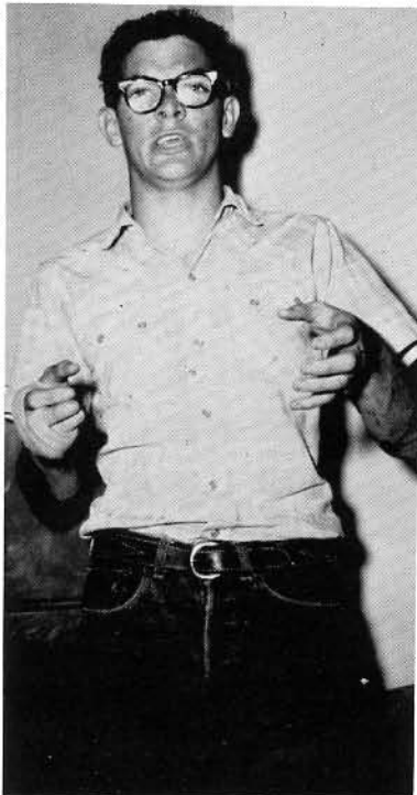
Besides the Twist, what are your qualifications for dancing school?