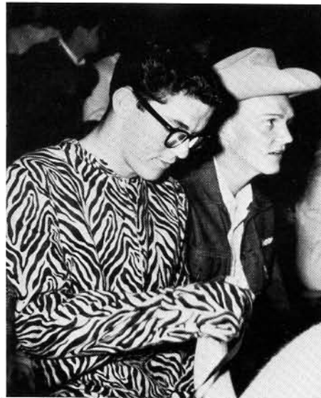
"Aw, Tommy, she'll understand when you tell her you couldn't afford to rent a tux for the prom!"