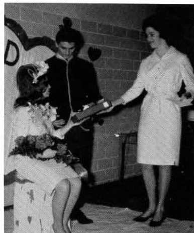
"Hope you like jig-saw puzzles."