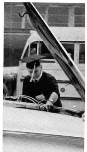
Mind over matter?