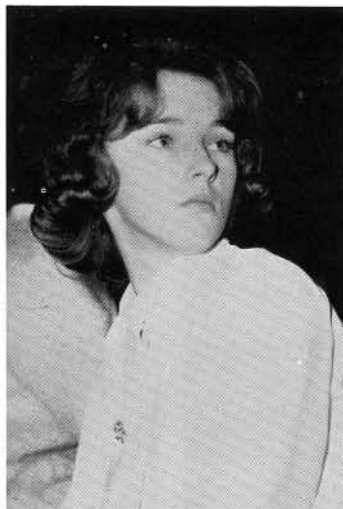
"Whatd'ya mean this is not the lunch line?"